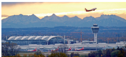
The attractiveness of BARIG as important airline association swings up to new heights.

The Maritim Hotel Ltd. has its main office in Bad Salzflen and is Germany's largest owner managed hotel chain, having 34 hotels at command and thereby offering area-wide hotel- and conference capacities of the highest segment. Moreover, Maritim International runs 15 hotels in Egypt, China, Turkey, Spain, Mauritius, Malta and the Netherlands.